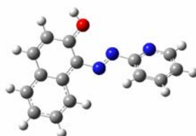
Figure 1 – 1-(2-pyridylazo)-2-naphthol (PAN) ligand

The resulting materials were characterized via surface analysis (SEM, XRD), chemical analysis, spectroscopic methods (FTIR and Raman) and cyclic voltammetry in aqueous medium with zeolite-modified electrodes.